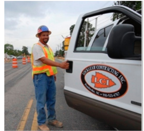
A Locklear Contracting supervisor prepares for a busy day providing utility installation and other site work services as a result of ARRA contracts for NCDOT.