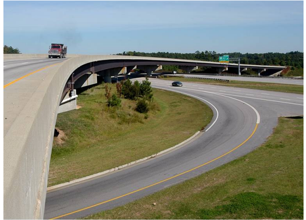
The USDOT Bonding Reimbursement Program provides funding assistance for DBEs performing on ARRA-funded transportation and infrastructure projects. Applications are due prior to Sept. 8, 2010.

This provision is applicable to a subcontract or prime contract at any tier in the construction project. Under this program DOT will directly reimburse DBEs the premiums paid to the surety company for performance, payment or bid/proposal bonds. The range of the premium fee is between 1-3 percent of the total bond amount. In the event the DBE also obtains a bond guarantee from Small Business Administration's (SBA) Surety Bond Guarantee Program (SBGP), the DOT also will reimburse the DBE for the small business concern (principal) fee of .729 percent of the contract price.